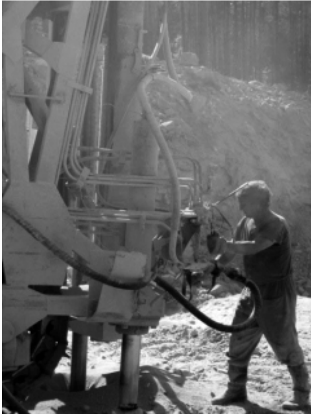
Russian Ministry of Transport

Highway construction in Russia. The government's new Investment Fund is designed for domestic investment in large-scale projects.