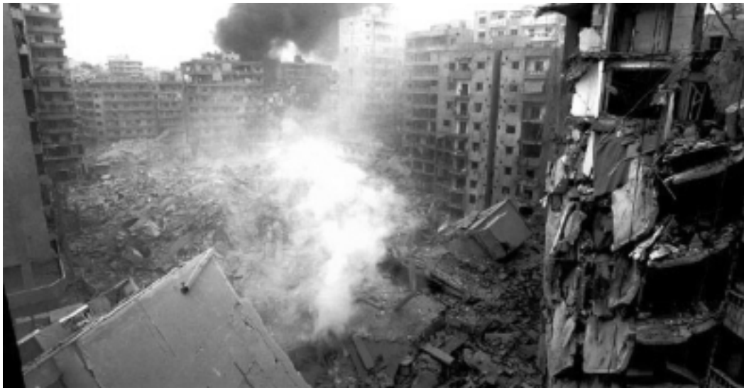
Embassy of Lebanon

With its relentless bombing of Lebanon, LaRouche said, "Israel has walked into something which is a piece of stupidity and a piece of willful suicide." Here, Beirut in July.