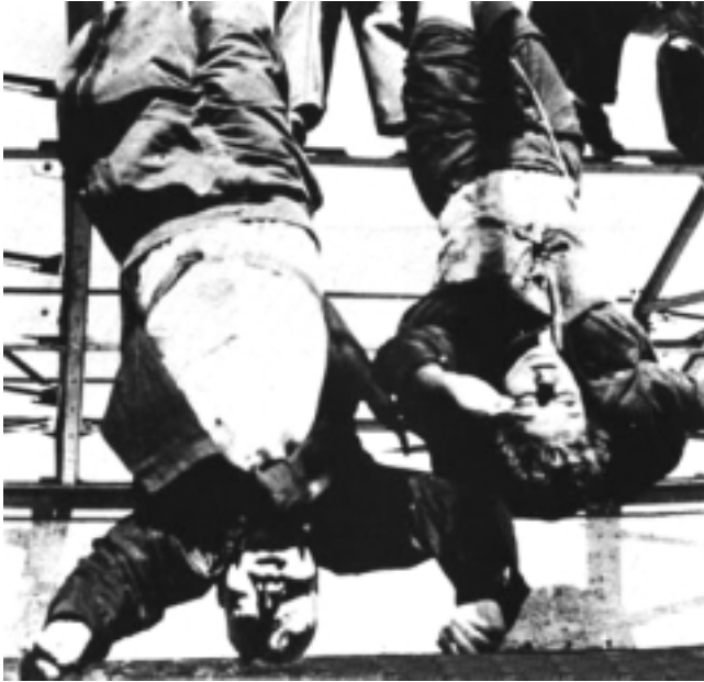
At the end of the war, Benito Mussolini was trying to cut a deal and blackmail Winston Churchill, who had previously been his controller. The British caught him and his mistress, Carla Petacci, and hung them upside-down.

vate financier interests, which, together with the Anglo-Dutch interests, became essentially a world empire. And what people think of as economics today, is largely a product of this system.