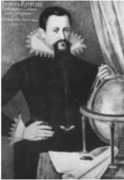
Johannes Kepler's revolutionary discoveries "provided the basis on which all leading accomplishments in European physical science have been centered since."

has more or less successfully impeded progress beyond Kepler's own richly confirmed study of what he knew as the Solar system. The development of the Biosphere out of the dynamic development within the Solar system, permits us to draw a limited range of firm conclusions, especially those bearing on the work of Vernadsky. What we know of the dynamic characteristics of the Noösphere beyond what Vernadsky presented, is largely concentrated in my own work in the field of a process of physical-economic development of societies as that process could have occurred, and could be continued in no way but in correspondence with my own refutation of the relevant "information theory" hoaxes of Norbert Wiener, John von Neumann, et al.