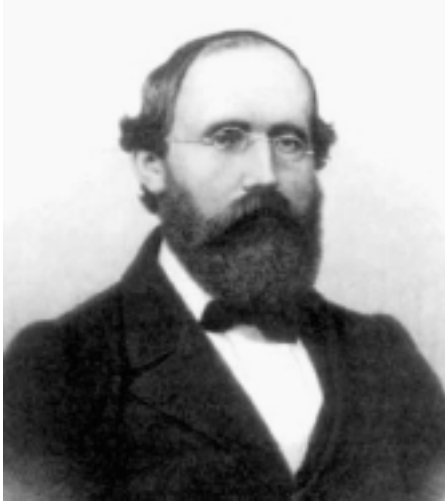
Bernhard Riemann focused the attention of modern science on experimentally premised principles, rather than aprioristic assumptions.

pean science since Johannes Kepler, was embodied in the central feature and consequent implications of Riemann's revolutionary 1854 habilitation dissertation. It is this view presented by Riemann which is echoed, in effect, in Vernadsky's view of the principled, dynamical character which distinguishes living processes from pre-biotic chemistry as defined today. It is the view of both Kepler and Riemann by Albert Einstein, which defines the needed essential view of science and economy today.