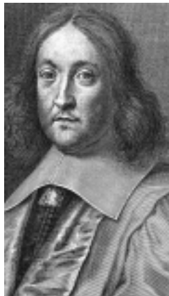
Pierre de Fermat

First , in historical order: Fermat's experimental demonstration of a principle of "quickest time," must be viewed in the context of Kepler's proof, for the case