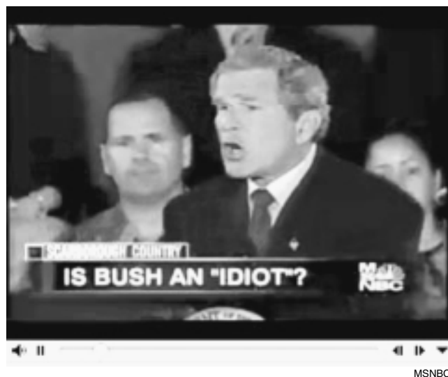
It doesn't take a genius to answer the question posed by former Republican Congressman Scarborough.

The most dramatic sign of the Establishment's conclusion that Bush is too lunatic to continue in office came on Aug. 15, when former Republican Congressman-turned-right-wing-TV news analyst Joe Scarborough aired a ten-minute segment of his "Scarborough Country," posing the question: "Is Bush an Idiot?" Throughout the segment, the words "Is Bush an Idiot?" ran across the bottom of the screen. The segment provoked a firestorm of media commentaries, including two subsequent "Scarborough Country" segments, an equal number of satirical assaults on President Bush's mental midgetry by