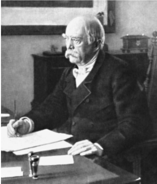
Germany's Otto von Bismarck. Engels' diatribe against Dühring was aimed at the latter's association with Bismarck's American-like economic reforms, as well as against American System economist Henry Carey's negotiations with Bismarck's advisors.

is the destiny implicit in the Anglo-Dutch Liberal geopolitical operations in the manipulation of the nations and ethnic and religious factions of the Southwest Asia cockpit of global asymmetric warfare today.