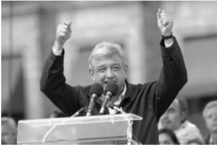
Official site of Andrés Manuel López Obrador

Mexico's Presidential candidate Andrés Manuel López Obrador is confronting the same forces which were imposed on Mexico by the combined British-French-Dutch-Spanish fleet: "To stick a Maximilian on the throne of Mexico, while you have a Benito Juárez in the form of López Obrador, associated with the people—this is an explosive situation for the entire hemisphere of the Americas. . . . And the hemisphere's ready to blow."