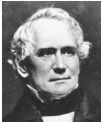
Library of Congress