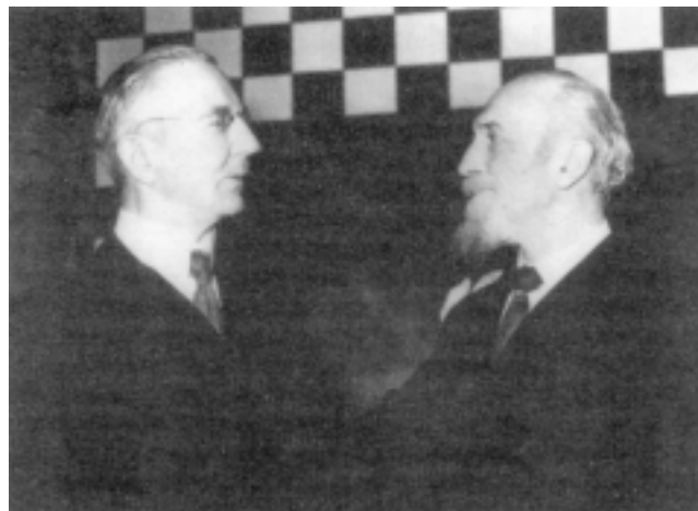
Bank of England Gov. Montagu Norman (right) with Reichsbank President Hjalmar Schacht. Norman, a former partner of Brown Brothers, was the most avid of Hitler's supporters within British ruling circles; Schacht, who became Hitler's Economics Minister, was Norman's protégé.

that we have drawn our line and should hew to it." 10