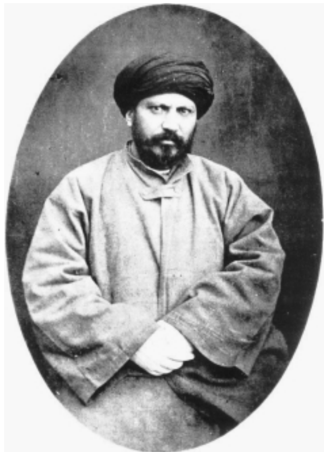
Jamal al-Din al-Afghani (1838-97) was a British puppet, and those who follow in his footsteps today are being used by British intelligence, including in the current fraudulent attacks on the Pope, "to bring Islam to self-destruction of its peoples from within."

This decadence spread within the Christian churches, including the Catholic Church, is typified by the accelerated shrinking of the clergy, through the combined effects of aging and death of the older ranks, and the lack of renewal of those ranks from younger volunteers. This decadence is also expressed, in appropriate forms, by the wild-eyed lunatic cults associated with the political base of increasingly demented U.S. President George W. Bush, Jr. Fewer and