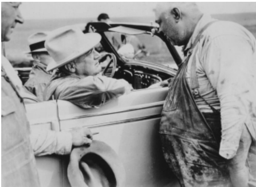
President Franklin D. Roosevelt in 1936, touring North Dakota. His orientation to “the forgotten man” was a sharp break from his predecessors. The changes introduced to the global economic system under his successor, Harry Truman, “have been the single most important of the ‘hereditary’ factors in shaping the long-wave course of world history” since FDR’s death, LaRouche writes.

except at risk of a general catastrophe which would sink the entire economy of the world into a virtual dark age. The only acceptable remedies would be changes within the U.S. system itself. It is the system presently associated with the dollar which must now be radically changed. There is presently no other visible solution.