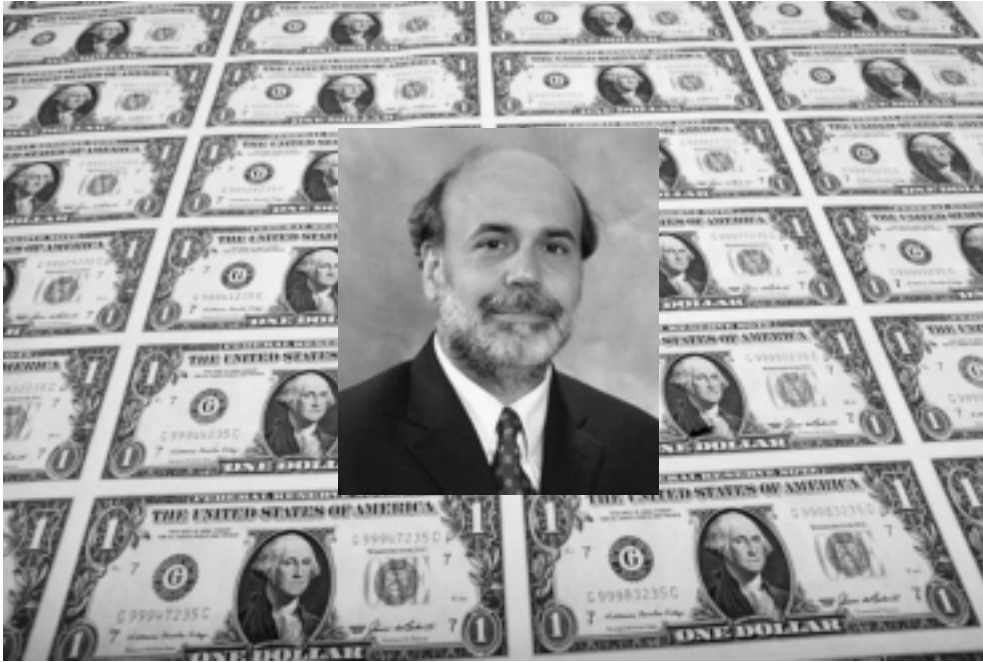
Federal Reserve Board Chairman Ben Bernanke inherited from his predecessor, Alan Greenspan, the “wall of money” policy which has impelled the world economy into hyperinflation. In a speech on Oct. 4, Bernanke conceded that there were some problems with housing inflation, but insisted that the main task at hand is to cut Social Security and Medicare as the Baby Boomers hit retirement age.

of the Creator? Why do we tolerate a condition of oppression against the lower eighty percentiles, and more, of our people inside even the U.S. itself, when the best men of England revolted during the late Fourteenth Century, to write and repeat: “When Adam delved and Eve span, who was then a gentleman?” Why do we, in our Federal Republic, with its Declaration of Independence and Federal Constitution’s reigning principle of constitutional law, its Preamble, tolerate the tyranny among us of our native imitations of that regrettable class of tyrannical critters from which we escaped when we thought we had left behind us the pestilences known as the aristocracy and usurers of “Old Europe”?