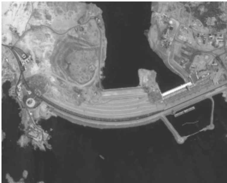
One 1,000-megawatt nuclear plant will supply Egypt with as much electricity as does the Aswan High Dam, shown here.

Sadat had set up a Higher Council for Atomic Energy in 1975 (the same body that has just recently reconvened), bringing together all the relevant personnel and groups, to study a national nuclear effort. The Higher Council, which