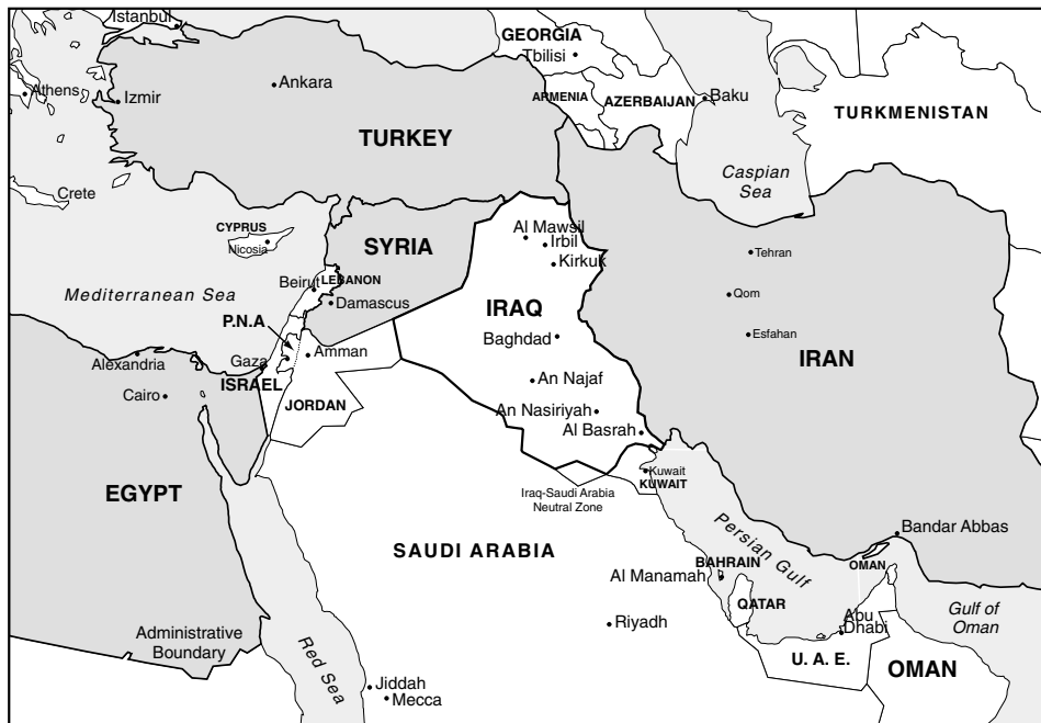
The four nations highlighted on this map of Southwest Asia, are crucial to the cooperative arrangement the U.S. must make, in order to stabilize the region.

kindred lawyers out of the policy-making. No attempt to develop a “detailed plan of withdrawal,” or negotiate a “contract” should be introduced prior to the achievement of a commitment to an agreement in principle among a relevant majority, at least, of the prospective partners to a new Southwest Asia security and development agreement. We must recall that the beginning of the ruin of the otherwise excellent agreements reached in the Oslo Accords occurred, once certain financial interests, such as those associated with the World Bank, were permitted to intervene, in the fashion of attorneys for banking interests, to distort the implementation of the agreements in such incompetent ways, that no serious economic-development measures were ever taken. That error created the vacuum of inaction in which the ensuing mischief by Netanyahu, Ariel Sharon, and others, ostensibly on both sides, took its toll.