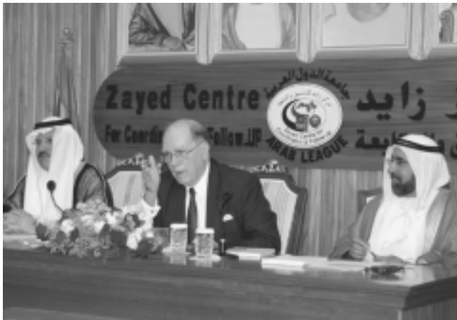
Zayed Centre for Coordination and Followup

Lyndon LaRouche speaking at the Zayed Centre in Abu Dhabi on June 1, 2002.