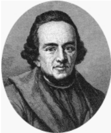
Moses Mendelssohn (1729-86), the great German-Jewish philosopher, was known as “the Socrates of Berlin.”

it is the question of how do you educate your emotions so that they play a better part in the role of cognition?