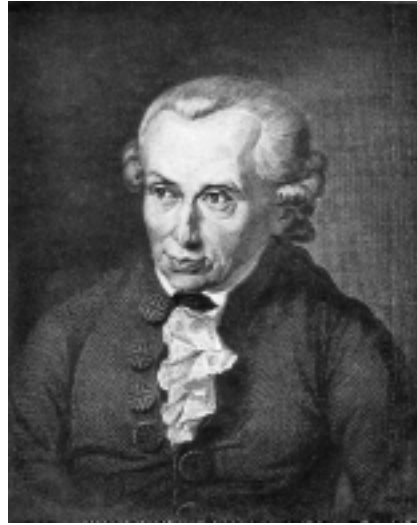
Immanuel Kant (1724-1804). He must have had a miserable childhood, Schiller wrote, to come up with such a wretched philosophy.

So therefore, the aim of Schiller is to have the beautiful soul. And, this beautiful soul is also a person who is not just looking at himself to be all of these things, but again, is a compassionate person. Here he says, in the same "On Grace and Dignity": "A beautiful soul does not know a sweeter happiness, than to see the sacred which he has in himself, repeated and imitated outside, and realized, and also embraced in the world of senses as their immortal friend.