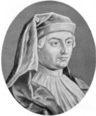
Rudolph Agricola was an Aristotelian of the 16th Century, who maintained that it is not truth that is the basis for judgment, but the manipulation of emotions.

reality is. So, the judgment, he says, does not occur on the basis of reality, but on the basis of the delusion of another affect, which a person has accepted because of another even minimal and unimportant influence. So, it's all about manipulation.