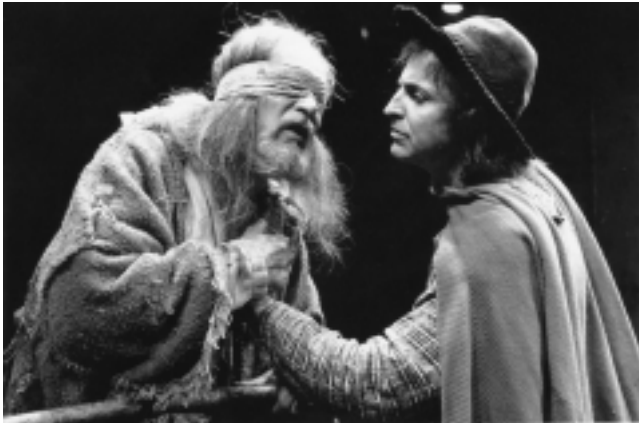
The Shakespeare Theater at the Folger

The blinded Earl of Gloucester with his son Edgar in a performance of Shakespeare's King Lear. The audience is deeply moved, wrote Lessing, when the suffering and the accomplishments of a character in a play are approximately in balance.