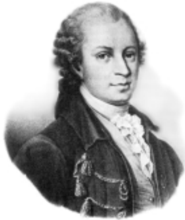
Gotthold Lessing (1729-81) believed that compassion is the only true emotion evoked by tragedy, whose purpose is to increase the feeling of compassion in the audience.

compassion turns into admiration. So, he says, horror and fright, and admiration, are only steps on a ladder, where the middle is compassion, and if it comes too soon, then he calls it Schreck , and if it goes too far, it becomes the Sublime, it turns into admiration. He says: The purpose of the tragedy is to increase the feeling of compassion. It is not supposed to teach us to feel compassion for this or that unfortunate person, in the concrete situation in the play, but to educate our emotions to feel compassion for all unfortunates at all times, in all situations, to move us to engage ourselves for them.