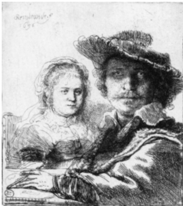
“Self-Portrait with Saskia” (1636). Rembrandt presents his wife Saskia as his “better half”—she radiates light, while his face is shaded—and as his muse; once again, he is at work, etching.

illuminates his “better side.” One art historian has suggested that the portrait could be an illustration of the Dutch maxim, Liefde baart kunst (Love gives birth to art). Rembrandt portrays himself as looking up from a sketch, for which his wife/muse Saskia is the model.