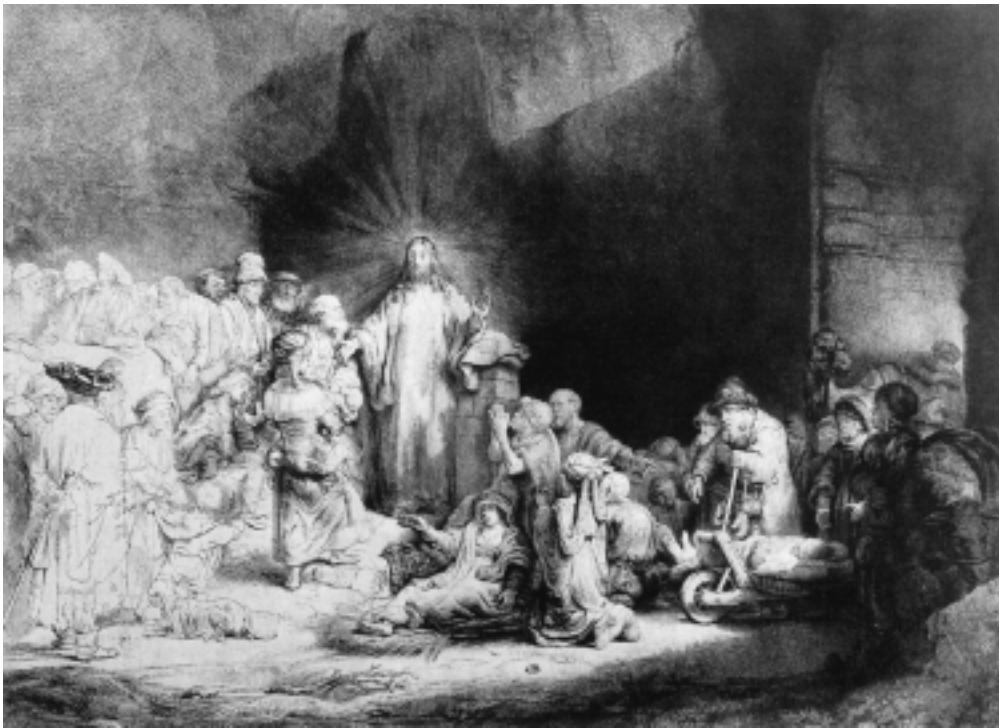
“Christ Healing the Sick” (1648). This etching, is one of Rembrandt’s most celebrated, also done the year of the Peace of Westphalia. The story is based on the Gospel of Matthew: “And great multitudes followed him; and he healed them there.”

Among them was Rembrandt van Rijn, now 50, who was declared bankrupt and whose possessions were put up for sale. The process leading to Rembrandt’s bankruptcy however, was not so simple; his finances unravelled over the decade of the 1650s, as powerful patrons abandoned him, and the vultures closed in. In January 1653, with the country at war with England, and finances tight, Rembrandt’s creditors called in their loans. The details of all this are somewhat murky, although certain facts are known. In order to hold off his creditors, he borrowed additional funds, while a large portion of his debt was sold off to that day’s version of hedge fund traders. Things continued to fall apart; two sales of his household goods took place by the late Summer of 1655. Finally, in November of 1657, Rembrandt was forced to sell off his house, and his entire art collection, a collection he had spent a lifetime gathering—dozens of Dürer and Mantegna prints; copies and engravings after the greatest works of art in Italy—those of Leonardo, Raphael, and others, as well as a quarter-century’s production of his etched copper plates.