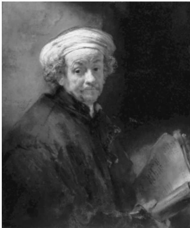
“Self-Portrait as the Apostle Paul” (1661). Rembrandt clearly identified with Paul; like Paul, the artist lived not for the pleasures of this world, but to create something immortal and universal.