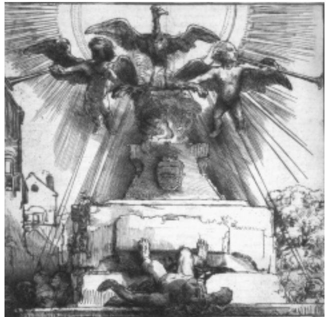
"An Allegory: The Phoenix" (1658). Rembrandt made this etching as he began to emerge from a long period of personal and financial tragedy. But he was undaunted. Like the legendary Phoenix, he rose from the ashes, and went on to produce his most sublime works over the next decade.