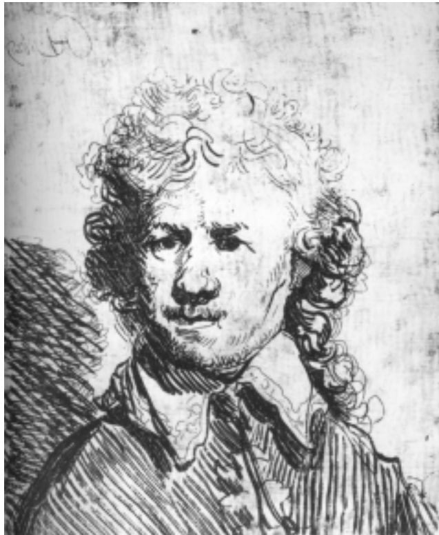
A self-portrait of 1629, when the artist is only 23; these are troubled times, but Rembrandt appears confident, even combative, and ready to take on the world.

power of mass organizing through the medium of prints (he owned several series of Dürer’s prints, along with those of the great Italian Renaissance artist Andrea Mantegna [1431-1506]). Each copperplate could produce hundreds of prints, and thus they were able to reach a wide market, whereas his paintings, which were commissioned by powerful and wealthy patrons, would be seen by only a privileged few. Through these prints—the equivalent of today’s leaflets and pamphlets—Rembrandt was producing what Lyndon LaRouche has called a “mass effect.”