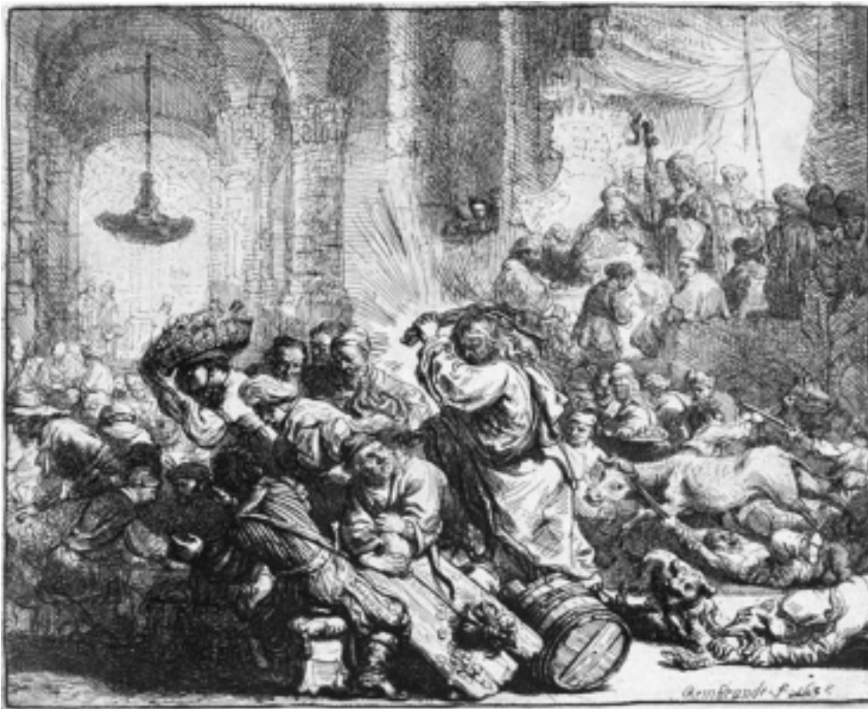
“Christ Driving the Moneychangers from the Temple” (1635). Rembrandt’s etching is a less-than-subtle message to the Dutch merchants and moneylenders, who have become “a den of thieves,” getting fat off the East Indies trade.

picture, which falls over the group to His right; but He also emanates a powerful light from within: By this light we can clearly “read” the expressions and thoughts on the faces of those around him, and in the motions of the supporting cast, those listening who come forward to hear him, and to be healed, both physically and spiritually. He is the “organizing principle” of the drama. The script Rembrandt has chosen for its dramatic potential, is taken from the Gospel of Matthew (19:1-30): “And great multitudes followed him; and he healed them there.” From the right, a crowd enters through the city gate: They are the sick, the crippled, the aged, who beseech His help. At the left of the stage, the Pharisees, the religious fundamentalists, who demand to know Christ’s “position” on “single issues,” like divorce: “The Pharisees also came unto him, tempting him, and saying unto him, ‘Is it lawful for a man to put away his wife for every cause?’” In front of the Pharisees, two mothers approach Christ, offering their children for His blessing, as Peter, at Christ’s right hand, tries to hold the women back, but Christ reproaches Peter: “Then were there brought unto him little children, that he should put his hands on them, and pray: and the disciples rebuked them. But Jesus said, ‘Suffer little children, and forbid them not, to come unto me: for of such is the kingdom of heaven.’”