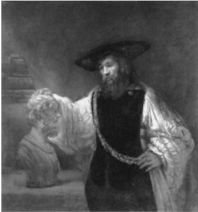
Rembrandt's painting, "Aristotle Contemplating a Bust of Homer" (1653), demonstrates his deep knowledge of history, literature, and philosophy: Aristotle only "knows" what he can learn through his senses, but the blind poet Homer, sees with his mind.

all knowledge is derived from the senses, thinks he can learn from Homer by placing his hand on the poet's head. Pity the poor philosopher, says the Rembrandt speaking to us from this portrait: All his fame, the heavy gold chain he wears, his splendid garments, will never bring him closer to the truth.