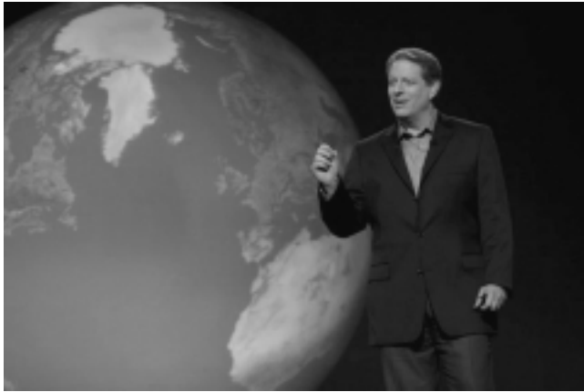
An Inconvenient Truth

Al Gore in his movie on "global warming." The lunacies such as "fraudulent, pseudo-scientific allegations respecting 'gases' as a factor in 'global warming,' must be abandoned in the interest of maintaining an environment fit for human habitation," writes LaRouche.