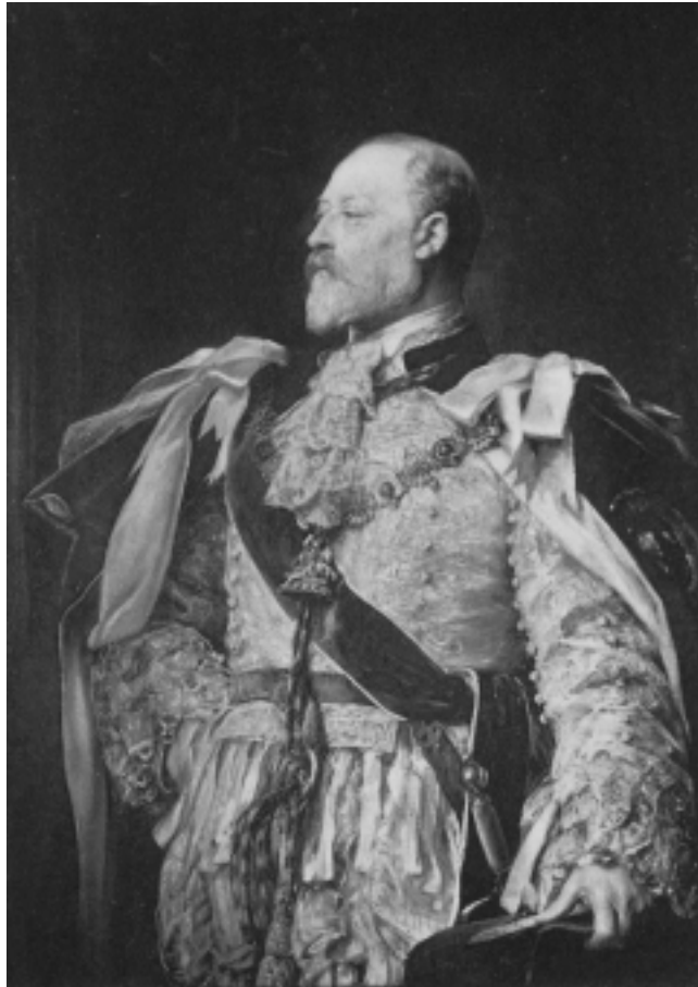
King Edward VII of Britain, in service of Anglo-Dutch Liberal financier-directed imperial policy, orchestrated the buildup to World War I. He played his silly nephews, Kaiser Wilhelm II and Czar Nicholas II, the Austro-Hungarian idiot, and the revanchists of France, against one another.

Were I President, that would be our policy, and we would succeed, with heartfelt blessings from our posterity on that account. While I am fortunate in my marginal advantage in health over most of my generation, the idea of my seeking two terms as President would seem to be a stretch of the imagination. If necessary, I would do the job, and that very well. Nonetheless, except some extraordinary emergency, for the next U.S. President, who could have the advantage of everything I might supply him, or her, what we need for the security of our republic's future is a candidate who becomes an efficient link to our future, a younger, if mature person, who could serve for two, or even three terms (if we decided to make that reform), and then serve effectively as a former President, as Eisenhower, Carter, and Clinton have done. We need a restored Presidency in the FDR tradition, whose reach of influence is the active adult lifetime of two generations to