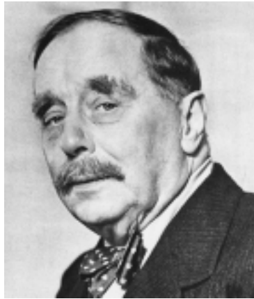
H.G. Wells, shown with some stills from his 1936 film "Things to Come," which portrays a future world at war. The world is later rescued by the "Great Air Dictator," who arrives from the "World Council" at Basra to demand an end to national sovereignty and submission to the international force.