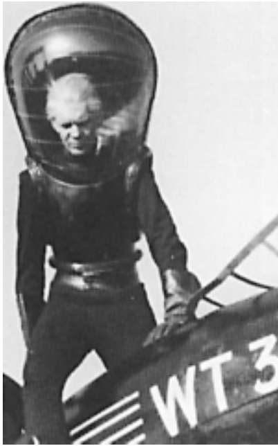
Library of Congress