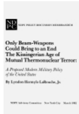
Left: Artist's depiction of an X-ray laser in space, a beam defense weapon based on new physical principles. Center: a 1982 pamphlet on beam weapons authored by LaRouche and (right) a 1977 pamphlet put out under LaRouche's guidance, "The Science Behind the Soviets' Beam Weapon."