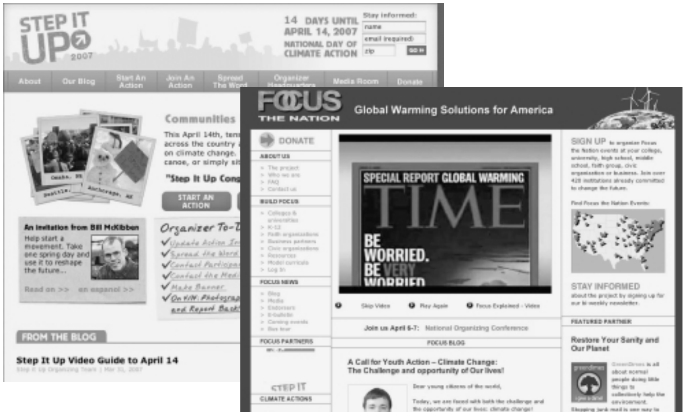
Two of the activist groups, or shocktroops, being organized to try to force through the genocidal program of energy cutbacks mandated by Gore's "global warming" hoax, are "Focus the Nation," and "Step It Up," whose websites are shown here. Don't let them turn your children, or friends, into campaigners for genocide.

Out of the November 2006 meeting came the launching of the nationwide organization, Step It Up, whose website states that the goal of the group is to achieve an 80% cut in carbon emissions by the year 2050—precisely the deindustrialization and genocidal scheme presented by Al Gore to a credulous U.S. Congress on March 21.