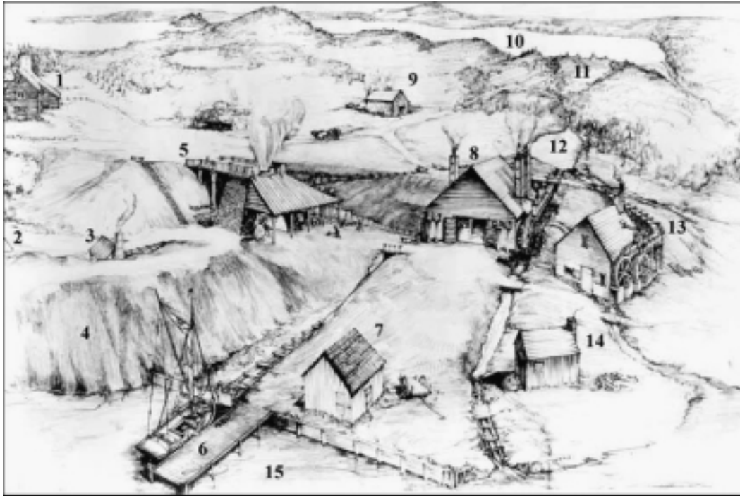
Saugus Iron Works National Historic Site

This drawing by Charles H. Overly, depicts the successful Massachusetts Bay Colony's Saugus Iron Works as it would have looked in 1650. Shown are the (1) Ironworks House, (2) Grist mill, (3) blacksmith forge, (4) slag pile, (5) blast furnace, (6) dock, (7) warehouse, (8) forge, (9) charcoal storage house, (10) Great Pond (main water supply), (11) canal to ironworks, (12) holding pond, (13) rolling and slitting mill, (14) blacksmith shop, and (15) Saugus River.