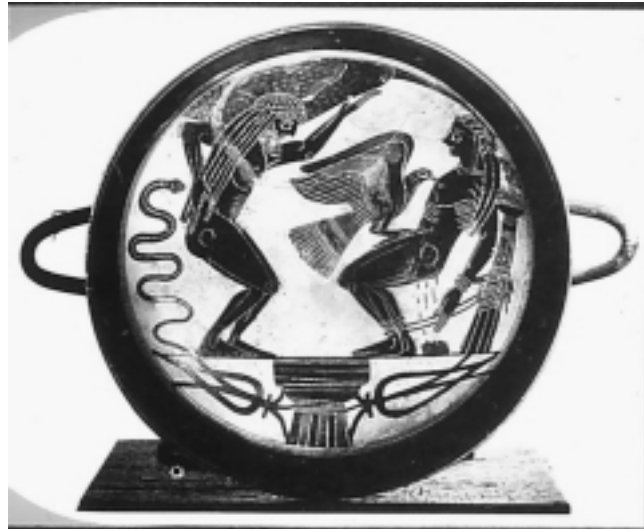
This Greek vase painting from around 500 B.C. depicts Prometheus (left) condemned by the Olympian Zeus to be bound on a desolate rock, where each day an eagle eats his liver. Prometheus' crime was to bring the gift of fire (and hence industry) to man, so that man would no longer be a slave. At right is Atlas, Prometheus' brother, who was also punished by Zeus, and condemned to hold up the sky.

Since the rise of what we recognize today as the ancient Greek civilization of about 700 B.C. and onward, European civilization, in particular, has been the victim of the vicious practices of what are known interchangeably as "imperial-