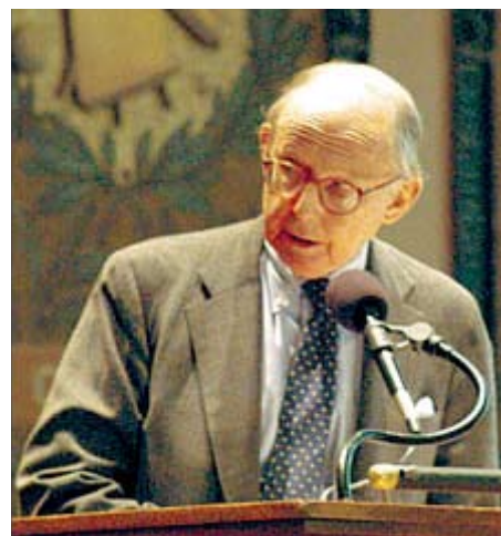
The long-term project to destroy the U.S. military from within goes back to Samuel Huntington’s 1957 book, The Soldier and the State . The method was provided by the “Military-Entertainment Complex,” which produces “games” like “ Ghost Recon: Advanced Warfighter ,” shown here (Huntington, above).