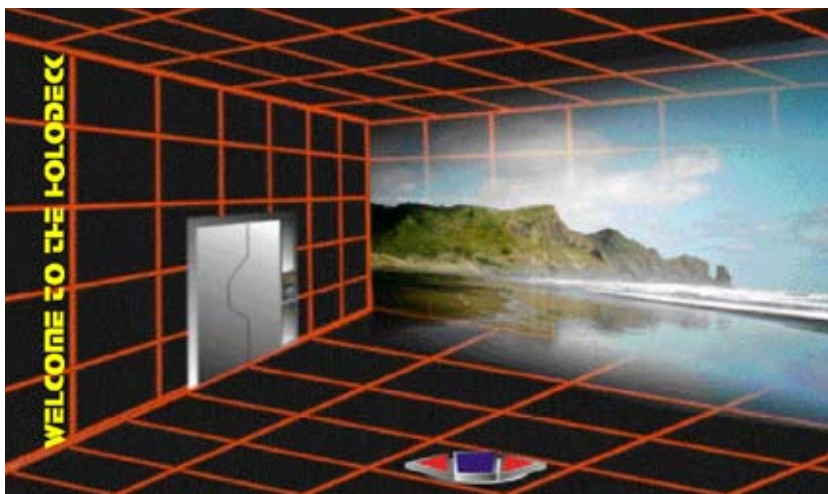
The mission of the Institute for Creative Technologies (ICT) at USC, is to construct Star Trek's "holodeck." Their mandate is to push the boundaries of interactive stimulation; so far, the sense experience is limited to wraparound projection screens, vibrating headsets, and a "scent collar" that can emit the authentic battlefield smells of gunpowder and Arabic spices. Shown: a computer image of a Star Trek Holodeck.

chologist Licklider in the 1950s), the military sought to create a "networked virtual battlespace," which would allow multiple people to train simultaneously on different modules. When SIMNET became operational in 1990, one of its first applications was the Army's Close Combat Tactical Trainer for tank warfare, which would be a major part of ground operations during Desert Storm.