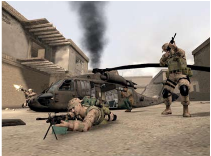
Like the extremely popular “Counterstrike,” “America’s Army” is a networked first-person shooter game, which takes the “recruit” through virtual boot camp and basic combat training before the start of a variety of simulated missions, all of it rendered down to authentic detail. Although it is a recruiting tool for the U.S. Army, the game is available free to anyone in the world with a computer and an Internet connection.

Though players gun down “insurgents,” and blow up buildings, cars, and people, developers emphasize that, more than anything else, these games teach “leadership skills” and teamwork.