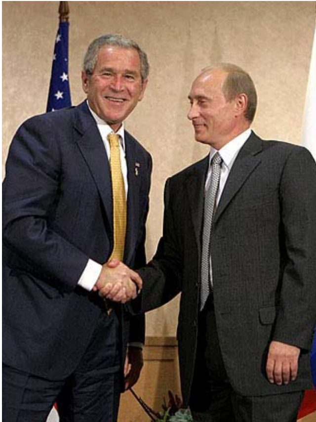
Russian Presidential Press and Information Office

Only a coordinated intervention by the Four Powers—the United States, Russia, China, and India—can avert a regional catastrophe, LaRouche warned. Here, Bush and Russian President Vladimir Putin meet on Sept. 7 in Sydney, Australia.