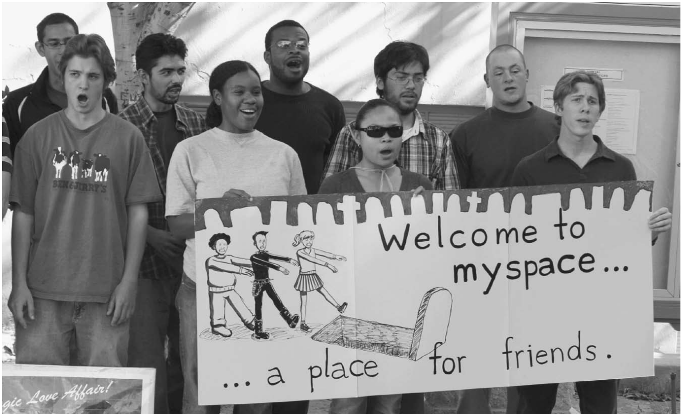
The LaRouche Youth Movement in Los Angeles, Nov. 15, 2007, scandalizing virtual reality.

• Computer games, particularly the homicidal maniac versions.