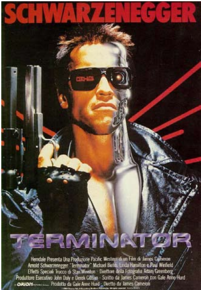
Arnold Schwarzenegger's portrayal of a cyborg in the movie Terminator typifies Wiener's notion of a learning-capable, self-reproducing machine (an ontological absurdity).

to be formally the same statement, according to the character of the objects with which it concerns itself—whether these are “things,” in the simplest sense, classes of “things,” classes of classes of “things,” etc. The method by which we resolve the paradoxes is also to attach a parameter to each statement, this parameter being the time at which it is asserted. In both cases, we introduce what we may call a parameter of uniformization, to resolve an ambiguity which is simply due to its neglect.