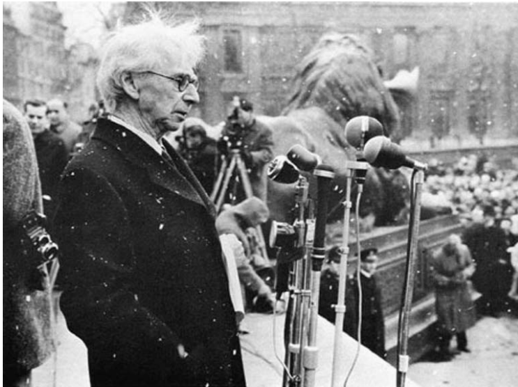
Bertrand Russell followed in the footsteps of Venice's operative Paolo Sarpi, in his mission to destroy scientific progress and its generator, human creativity. It was from Russell, that Wiener contracted the Sarpi "virus."

correction, until a vast patchwork structure ultimately broke under its own weight. Just as the Copernican system arose out of the wreck of the over-strained Ptolemaic system, with a simple and natural heliocentric description of the motions of the heavenly bodies instead of the ... complicated Ptolemaic geocentric system, so the study of non-linear structures and systems, whether electrical or mechanical, natural or artificial, has needed a fresh and independent point of commencement."