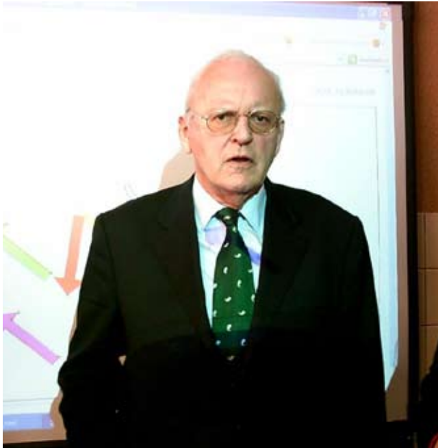
Former German President Roman Herzog advised that the European Treaty should be rejected, because if it were implemented, Germany would no longer be a parliamentary democracy.

and the Stability Pact have practically created a corset for the European states, which—as can be seen with the euro—means not only that the national governments no longer have sovereignty over their own currencies, that there is no “lender of last resort” in Europe—which is not so problematic, if everything is running normally, but also that if a real banking crisis occurs, as we have now, then the Bundesbank and the BaFin are ostensibly the “lenders of last resort,” but they have no sovereignty over the euro, and [European Central Bank head] Mr. Trichet said quite clearly, at a press conference: “That is not in our interest. We are not in charge of national bailout packages.” Here is a real loophole in the law, which now already exists. What is now about to occur with the Treaty of Lisbon, is a massive obstruction of democracy, constitutional legality, and sovereignty. For what would occur with this treaty, if it were ratified, is that constitutional sovereignty would devolve to the European Council; the European Parliament would no longer have to agree to anything, but would only listen—to say nothing of the national parliaments.