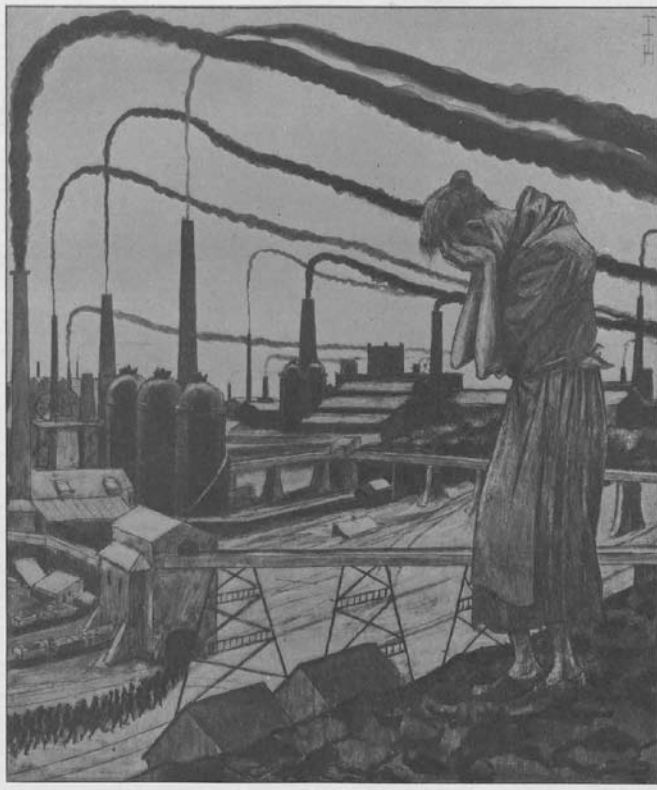
The Versailles conditions imposed on Germany at the end of World War I, led to the explosion of hyperinflation in 1922-23, and the collapse of German industry. Today, with the final stage of collapse of General Motors, the United States has almost ceased to be an industrialized nation. Below: a GM transmission plant in Baltimore, Md., 2007; left: a 1923 German cartoon, illustrating the destruction of the Ruhr region, and its effect on the population.