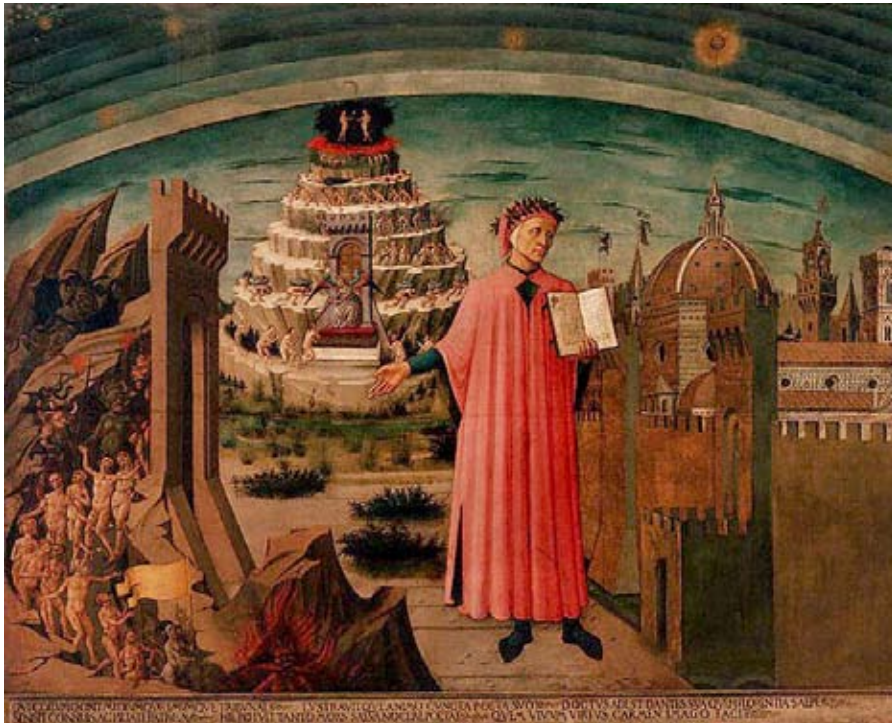
There was “a very long dark age, despite Dante’s great work, until the beginning of the Renaissance, with 1439” and the Council of Florence. This painting, “Dante and His Poem,” by Domenico di Michelino (1465), shows Dante holding his Divine Comedy, with the great dome on the Cathedral of Florence (completed more than a century after Dante’s death), where the Council took place, in the background.

sign and Keynes’ design. Keynes presented his design originally, in Germany, in Berlin, in an edition of his famous book, in which he said that he was publishing the book in Germany, because he thought that under Nazism, his ideas would have a more favorable hearing than in a democratic state. In principle, Keynes was correct in his estimation.