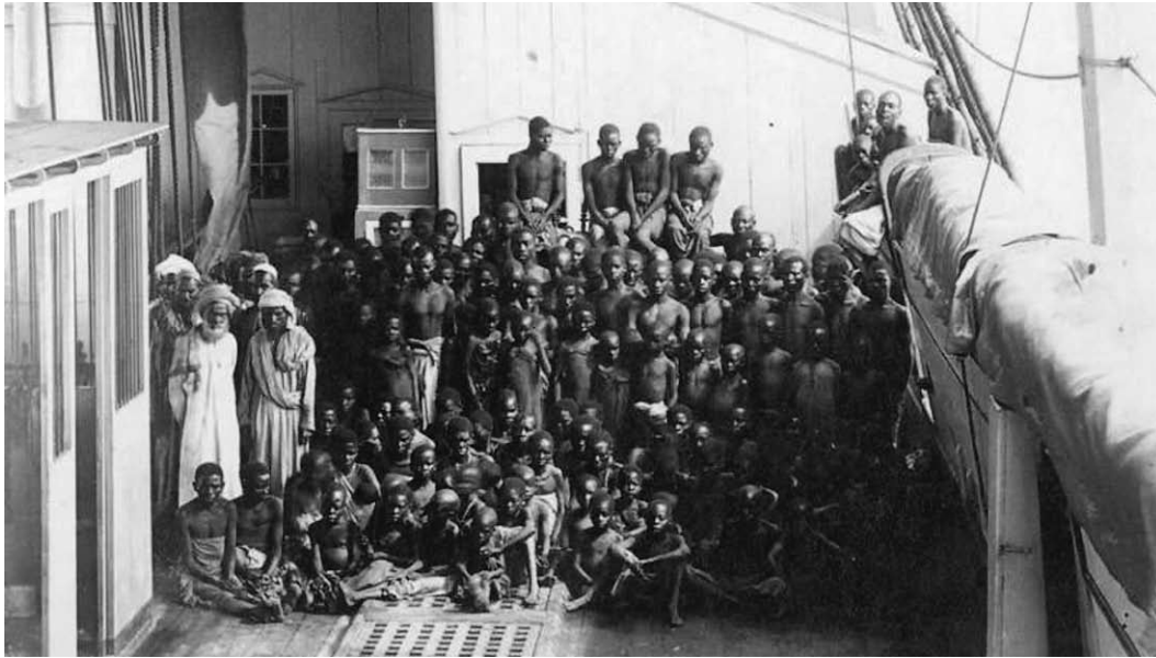
The British East India Company's economic model was to impose a global system of colonial looting, which caused repeated famines in India and elsewhere. Here, the Indian Ocean slave trade.