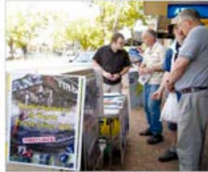
Lyndon LaRouche, Jr. (left) LaRouche's "bill" (shown at right) is a spearhead for reforming the U.S. and Australia to stop home foreclosures and to create a "bill" against the global financial collapse. Also: The U.S. organizing in Melbourne.

Two million copies of the CEC's New Citizen newspaper, featuring LaRouche's webcasts and writings, have been distributed Down Under, to a total population of 21 million.