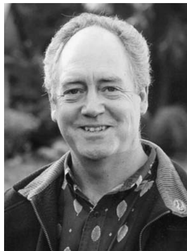
Clean and Safe Energy Coalition

Moore: The reason I changed my mind on nuclear energy is fairly simple, and it started with the fact that our initial campaign in Greenpeace was against nuclear weapons testing, and against the use of nuclear weapons in general, and the fear of an all-out nuclear war. It was during the Cold War, in the late 1960s, early 1970s. It was also the height of the Vietnam War. There was just a lot of war going on, and we were afraid that there was going to be an all-out exchange of