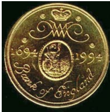
Montagu Norman (left), governor of the Bank of England (1921-44), helped fund Mussolini and Hitler. A coin of the Bank of England, commemorating 300 years of imperial rule. And Norman's current-day successor, Mervyn King. No more Mr. Nice Guy.