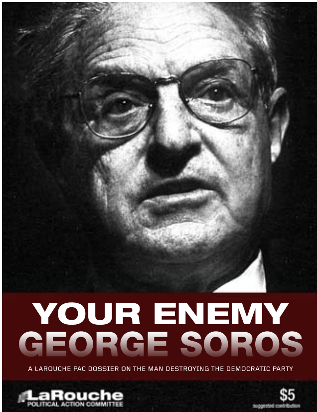
The LaRouche PAC's pamphlet "on the man destroying the Democratic Party."

dom's Foreign and Commonwealth Office; and the European Union's "European Instrument for Democracy and Human Rights," whose initiatives are enmeshed with and co-managed by the Soros apparatus.