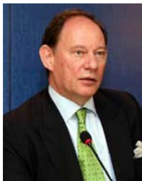
European Parliament Edward McMillan-Scott

In his intrigues with respect to Arab countries, McMillan-Scott fancies himself a reincarnation of his relative Lawrence of Arabia, whose photograph graces the McMillan-Scott website.