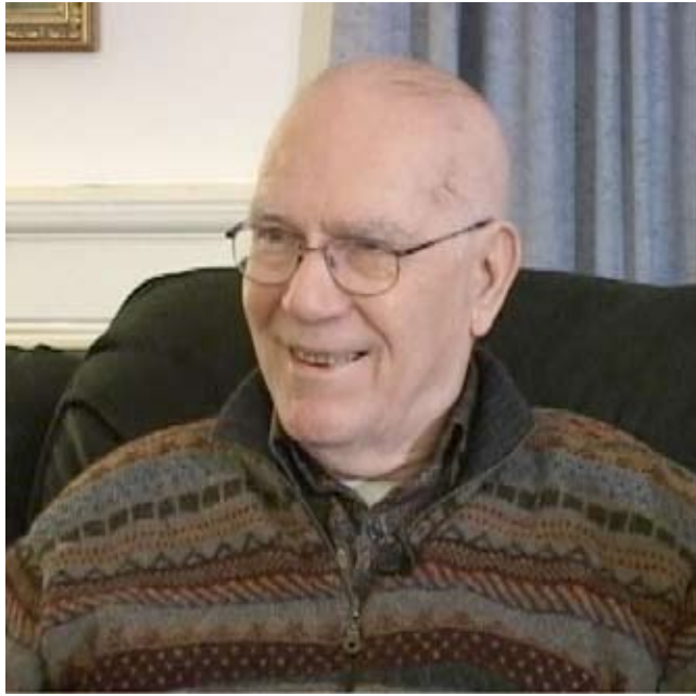
Lyndon LaRouche, as he appears in the 2008 LaRouche PAC DVD, "Firewall in Defense of the Nation-State."

work, anyway. We're now in the biggest financial crisis since the 1930s, since the early 1930s: This one is worldwide, and it's more serious now than anything then. And there is no attention, by either of the two putatively leading candidates now, to any of these issues! That is, what they're saying has no relevance to the cure of the problem which is crushing us, now. And that's where the problem lies.