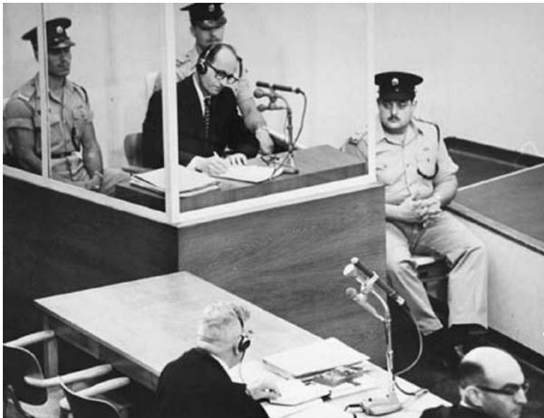
George Soros (below), Obama's perfidious owner, got his training under Nazi mass murderer Adolf Eichmann, LaRouche said. "What he [Soros] described as his life under Hitler, under Eichmann—he said it was the happiest time of his life!" Eichmann is shown during his trial in Jerusalem in 1961. He was executed for crimes against humanity.