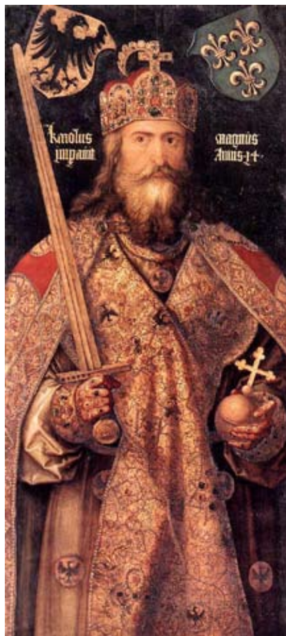
Charlemagne (747-814 A.D.), shown here in a painting by Albrecht Dürer, did much to develop the physical economy of Europe. Crucial features of his contributions lived on and helped to shape the later emergence of the Renaissance.

The most urgent political task among nations today, especially the trans-Atlantic ones, is to trace out the most essential elements of those methods of the August-