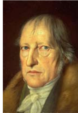
Evans-Pritchard's reference to the "Hegelian broth nearing the boil in Europe" is apt—but his notion of "the Left" misses the point. Hegel (above) worshipped Napoleon Bonaparte (left, in a painting by J.A.D. Ingres, 1806).

the legacy of U.S. President Franklin D. Roosevelt; I have been that, consciously and consistently, since nearly seventy-four years ago; yet it is no contradiction that I have also been among the best qualified internationally in the assessment of Karl Marx's work as an economist, and have been associated, occasionally, with nominally Marxist ventures. However, despite my early 1943 assessment of the Marx of what became known as the first volume of his Capital , as admissible for legitimate consideration among reasonable people, I was, and have remained, essentially, what I had already become years earlier, a follower of both Leibniz, since my adolescence, and, later, of Riemann since early 1953.