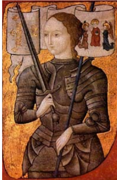
Athena (left) fought against the whispering of the evil gods and demi-gods—that root of real-life tragedy. Similarly, Jeanne d'Arc (right) took leadership and saved France. The bust of Athena is a copy of a statue from Athens of 430-420 B.C. Joan is portrayed in a miniature painting from the 15th Century.

identified with Moloch (or, perhaps “Moloch-Brown”?), or the Delphi cult’s Gaea, Apollo, Dionysus, et al. It is the prohibition of mortal man’s knowledge of the “fire” of science, lest man risk the displeasure of the pagan gods, which is the expression of the enemy of mankind within the body of mankind, a notion of the true evil on whose combat we have, thus far, relied to rescue societies from the perpetual whispering of those malignant gods and demi-gods of the Iliad .