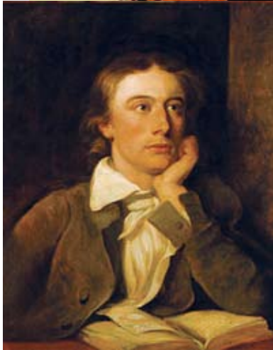
Keats' (left) "Ode on a Grecian Urn," achieves "the quality of a perfectly ironical Classical poem."

ley's In Defence of Poetry , which have affected me most strongly since my adolescence. 16 The first, for its achievement of the quality of a perfectly ironical, Classical poem; the latter, especially its concluding long paragraph, peering into the mirror of my soul.