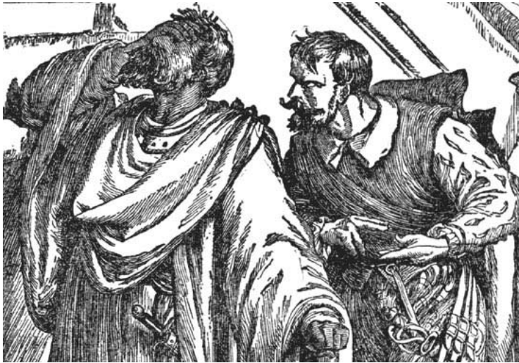
The characters in Classical tragedy are induced to cause their society to doom itself by the influence upon them of the whisperings of conspiring gods and demi-gods, like the whispering Iago of Shakespeare's Othello (shown here).

ring assault on our republic by the tragic principle, takes the principal form of ensuring, often successfully, that intellectually and morally failed persons will be brought in to occupy the Presidency itself. The miracle of the U.S. Constitution is that the republic has survived, so far, despite inherently failed Presidents such as, most conspicuously, Richard Nixon, Gerald Ford, Jimmy Carter, George H.W. Bush, and George W. Bush, Jr.