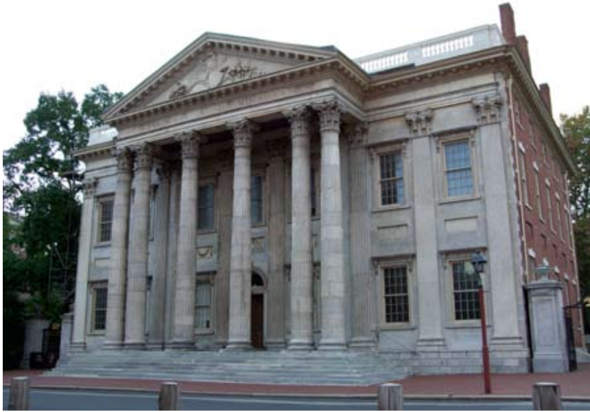
The new National Bank will open wide its discount window for lending of directed credit to the economy for productive industry, agriculture, and infrastructure. Shown: the First Bank of the United States, Philadelphia.

orderly flow of disbursements by the United States Treasury;