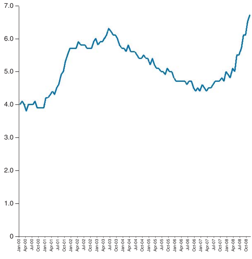
FIGURE 1 U.S. Unemployment Rate, Jan. 1, 2000-November 2008 (Percent)