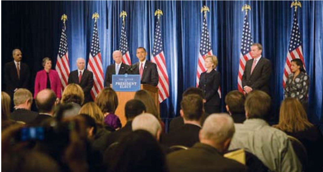
Obama-Biden Transition Project

President-elect Barack Obama presents those nominated for his national security team, on Dec. 1. LaRouche said that the new administration will include “a number of friends and collaborators of mine,” and that he is advising them to “put the entire world through a financial reorganization, in the direction of the policies of Franklin Roosevelt in 1944.”