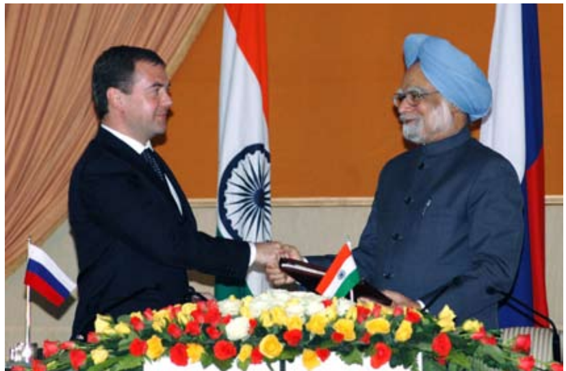
Division of Information & Broadcasting, Government of India

Is this feasible? Well, we are at an end of an epoch. The neoliberal paradigm has failed. The system of globalization, the neoliberal free-market system, today, is more bankrupt than the Communist system was between ’89 and ’91. And the only way the world will get