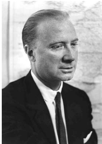
Albert Wohlstetter

What do His Royal Highness and the now-deceased “Dr. Strangelove” have in common? They both want to reduce the human population and stop civilian nuclear power.