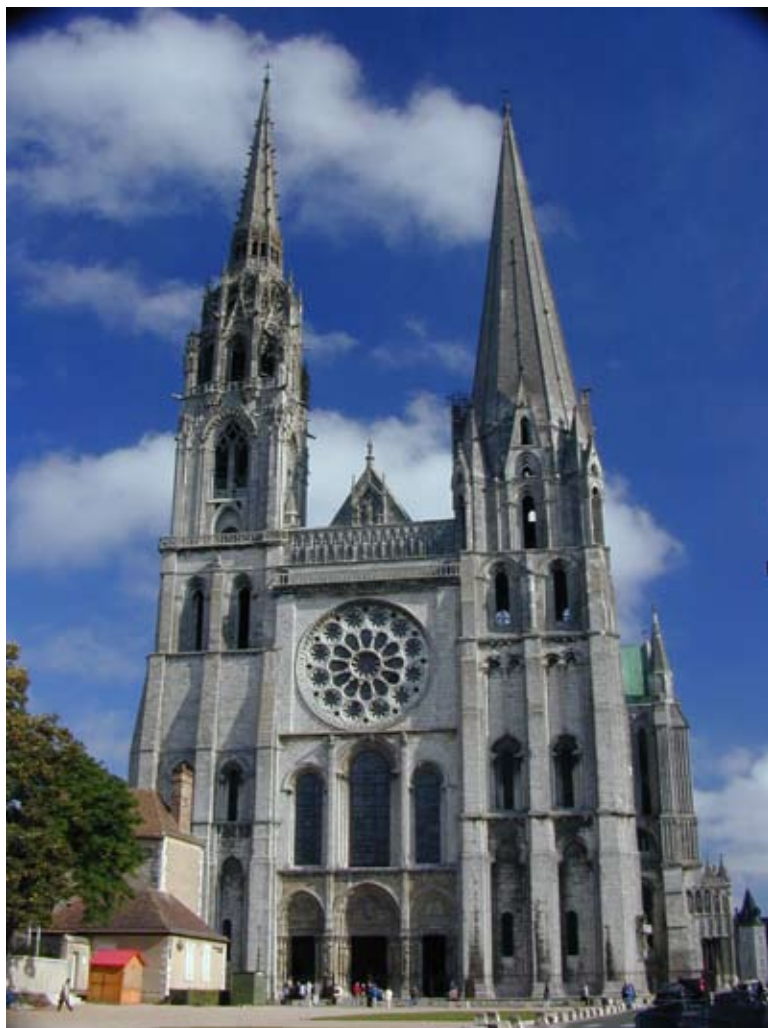
Creative Commons Attribution 2.5

In Germany, if we do not go back to the German Classical period, Germany will not make it. And if we do not go back to the highest point in our cultures, soon the Cathedral of Cologne and the Cathedral of Chartres will find themselves in a museum in Mongolia, as a fossil of a culture which didn’t make it. And since I don’t want this, we should shape up, and take a mission to really play a constructive role in the period to come. Because we are, right now, at the greatest crisis in