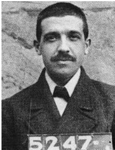
The Madoff Ponzi scheme was not an aberration; it is paradigmatic of the entire global financial system, based on the insane and immoral idea that "money makes money." Shown, a police mug shot of Charles Ponzi, who pioneered such fraudulent "money-making" hoaxes, in the 1920s.

Now, the reason I'm telling you this story is: The whole system of globalization is exactly that. And I think this is something which is very important to realize. Because when all the "creative credit instruments" of Alan Greenspan were invented, they did exactly that—they took, for example (I'm going through one particular phase), they took the subprime mortgages, which everybody should have known from the beginning could not work: You give a mortgage to somebody