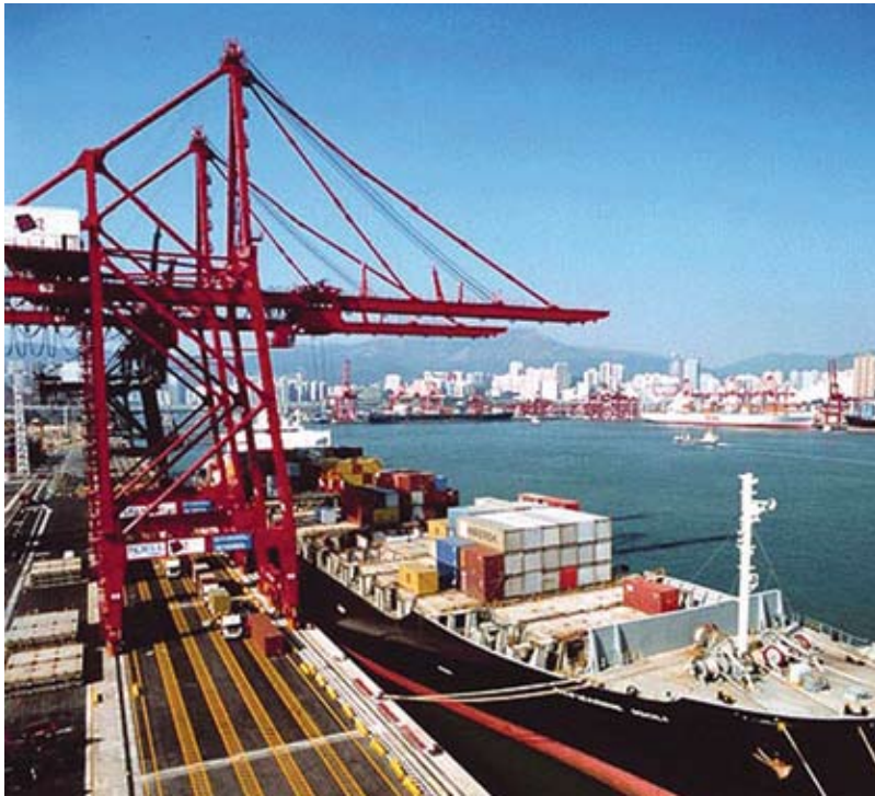
Hong Kong Economic & Trade Office

One element of the global collapse is the near-shutdown of international shipping: 96% of bulk-trade shipping has collapsed, according to the Baltic Dry Index; now ships sit in ports, like the Hong Kong port shown here.