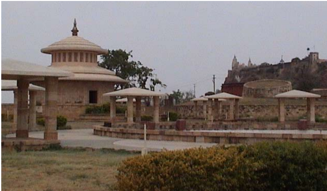
The only way the world will get out of this crisis, Zepp-LaRouche said, is if each nation goes back to highest point of its culture, for example, the Gupta period in India (4th-5th Century A.D.), when the greatest Classical works were written in Sanskrit. Shown: the Kalidas Smarak, a memorial to the Classical Sanskrit poet and dramatist, Kalidas, of the Gupta period.

out of this crisis, is if, in the coming period, at least factions of each country—not everybody immediately, because of the stupefaction which has occurred—but that important sections in each nation and in each culture are going back to the best tradition of their culture. And, in universal history, if you look at it as a totality, you had, fortunately, the torch of progress of civilization being given from one culture to the next: You had at a certain point, the Indians being the highest culture; at another point, the Chinese; and still another point, the Muslims; then you had the Italians; you had the Spanish; you had the Americans 200 years ago. So, in a certain sense, all we have to do, is to go back to our best traditions, and then communicate among each other on that level.