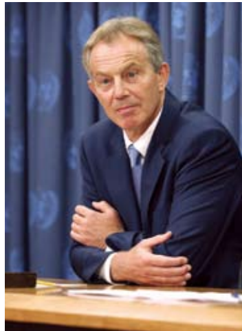
Tony Blair in New York, September 2008.

Their demand is that Obama’s Washington fall in lockstep with a green-fascist world regime of deindustrialization, carbon swaps, and windmills. And London refuses to accept the fact that the Group of 20 has booted “climate change” off the agenda of its April 2 summit on the world economic breakdown