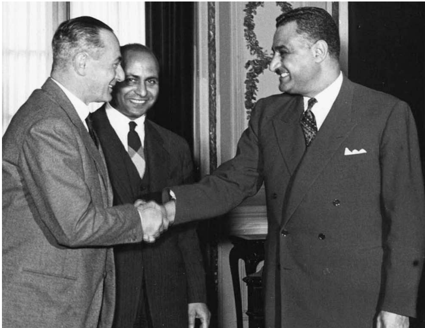
In 1957, Mattei (left), signed a deal with Egyptian President Nasser (right) for ENI to develop Egypt's oil. At the same time, Mattei proposed to President Eisenhower that the U.S. and Italy, along with other Western European countries, carry out a long-term economic development project to raise living standards in North Africa.