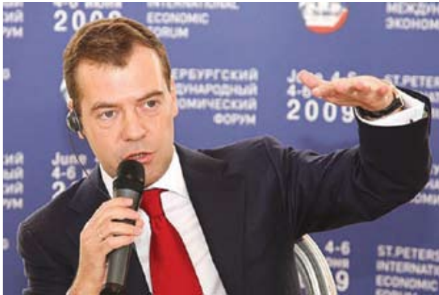
Russian Federation Press and Information Office

Russian President Dmitri Medvedev addresses the Petersburg Economic Forum on June 6, 2009. In his keynote speech, he promoted the City of London's agenda for a world currency.