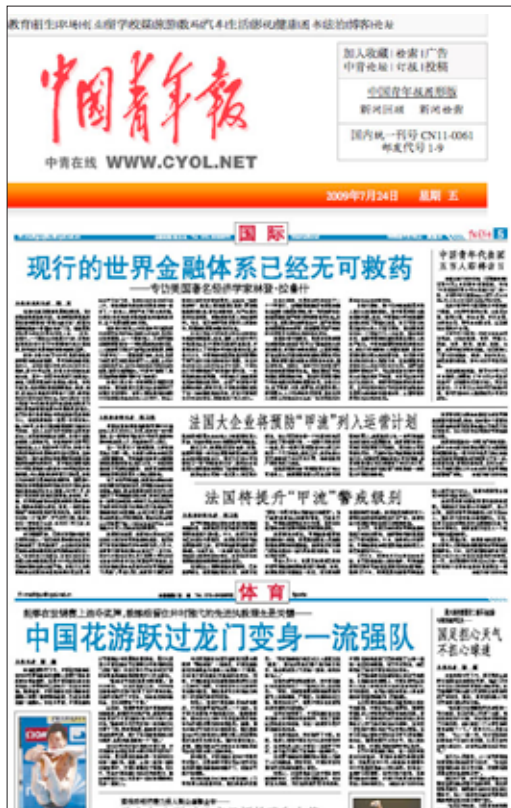
The July 24 China Youth Daily interview with Lyndon LaRouche leads the front page

“LaRouche believes that the development of Asia will, in the future, take the lead in the development of humanity, and that China is the key to the Eurasian continent. LaRouche notes that China has experienced 30 years of rapid development, by leaps and bounds, but it can’t be denied that there is still a large portion of the population which is far from well-off. Therefore, it’s necessary to formulate a common policy, over three generations, to carry through water projects, develop energy resources, and infrastructure, in order to raise the productive capabilities of that portion of the population.