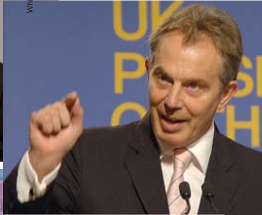
Council of the EU