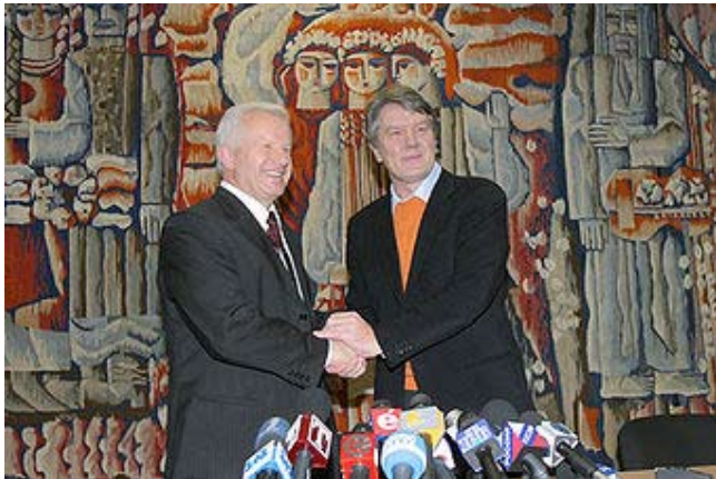
The Orange coup of 2004 placed Viktor Yushchenko (right), shown here with Speaker of the Parliament Olexandr Moroz, in the Presidency of Ukraine. Under former President Leonid Kuchma, and now, Yushchenko, Ukraine was handed over to the financial oligarchy, which is committing genocide against the nation, Vitrenko charges.

What is Ukraine going to pay with? I think that the plans of Washington and Brussels are to drive Ukraine to total bankruptcy, in order then to buy up our land at fire sale prices—Ukraine has 20% of the world's black earth soils—and take over our natural gas transport network, as payment of the debt.