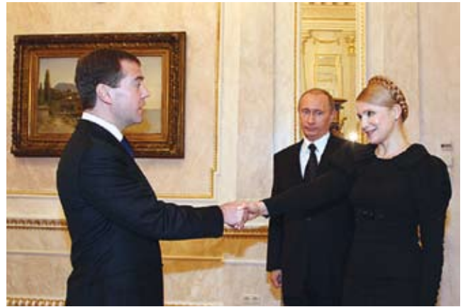
Prime Minister Yulia Tymoshenko, shown here at the Kremlin with Russian President Medvedev (left) and Prime Minister Putin, Jan. 17, 2009, "is playing a terrible game," says Vitrenko, lying about the state of the economy, as real wages collapse and unemployment soars.

In other words, Prime Minister [Yulia] Tymoshenko is playing a terrible game, setting loose a monstrous fraud, in that there is no economic capacity, but she puts up the pretense that wages are being paid, pensions are being paid, and that life goes on in the country. And although the real wages of the population fell by 10% in this same period, and wage arrears of $200 million have piled up (if we express the amount in dollars), there are no general, universal uprisings. Think about it: People go to work, and do not receive their wages. $200 million in unpaid wages, if we recalculate it in dollars.