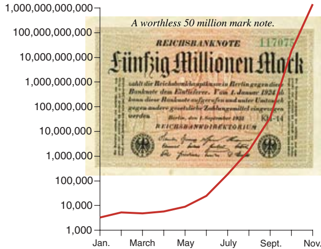
FIGURE 2 Weimar Hyperinflation in 1923 (Wholesale Prices, 1913=1, Logarithmic Scale)

The current financial-economic crisis is a global echo of the breakdown-crisis which the Versailles Treaty imposed upon Germany. The Treaty's demands for draconian reparations erupted into the hyperinflation of 1923, creating the conditions for Hitler's rise to power.