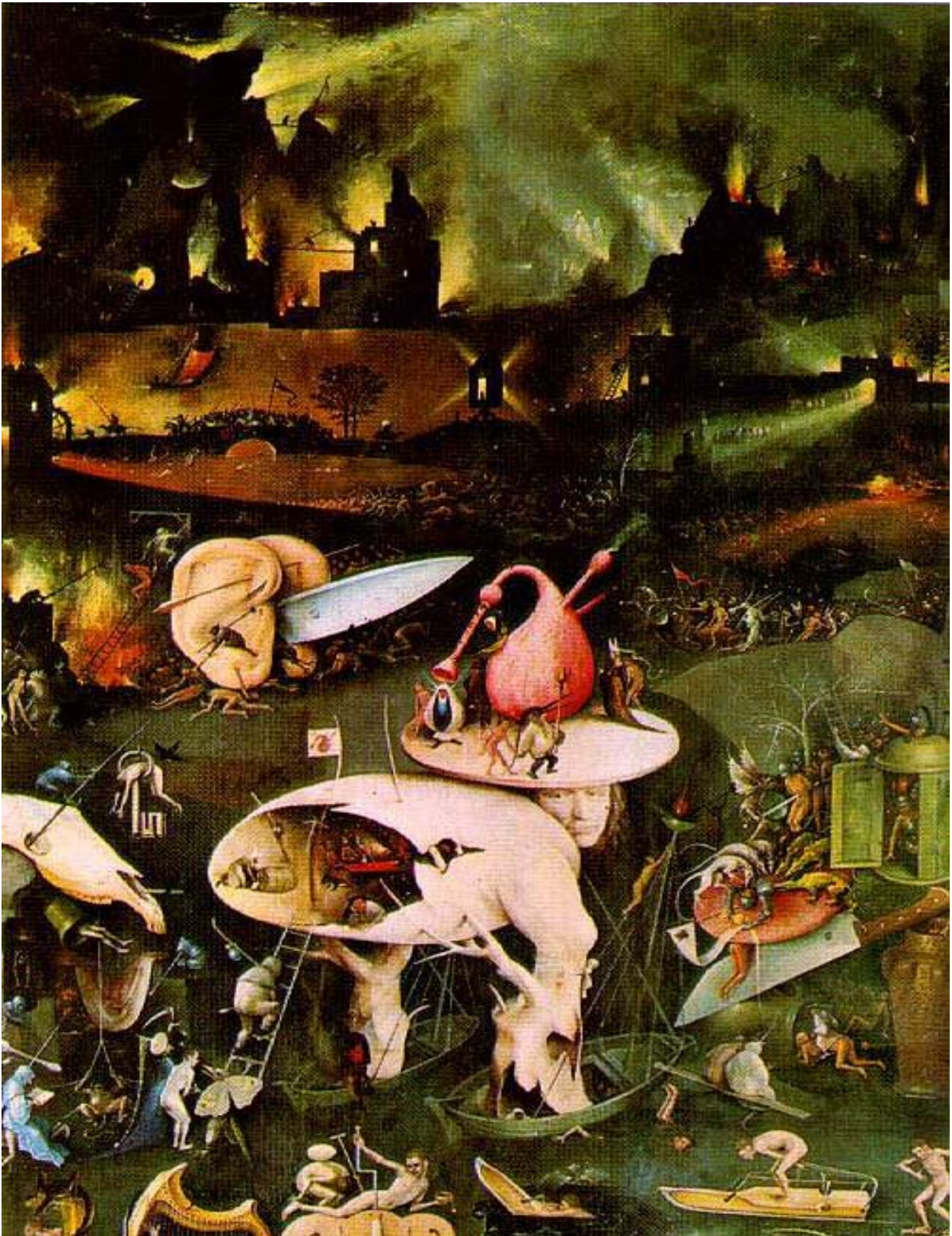
An image of the horror of an earlier Dark Age: detail from "Hell" in the "Garden of Earthly Delights" triptych (1503-04) by Hieronymus Bosch.