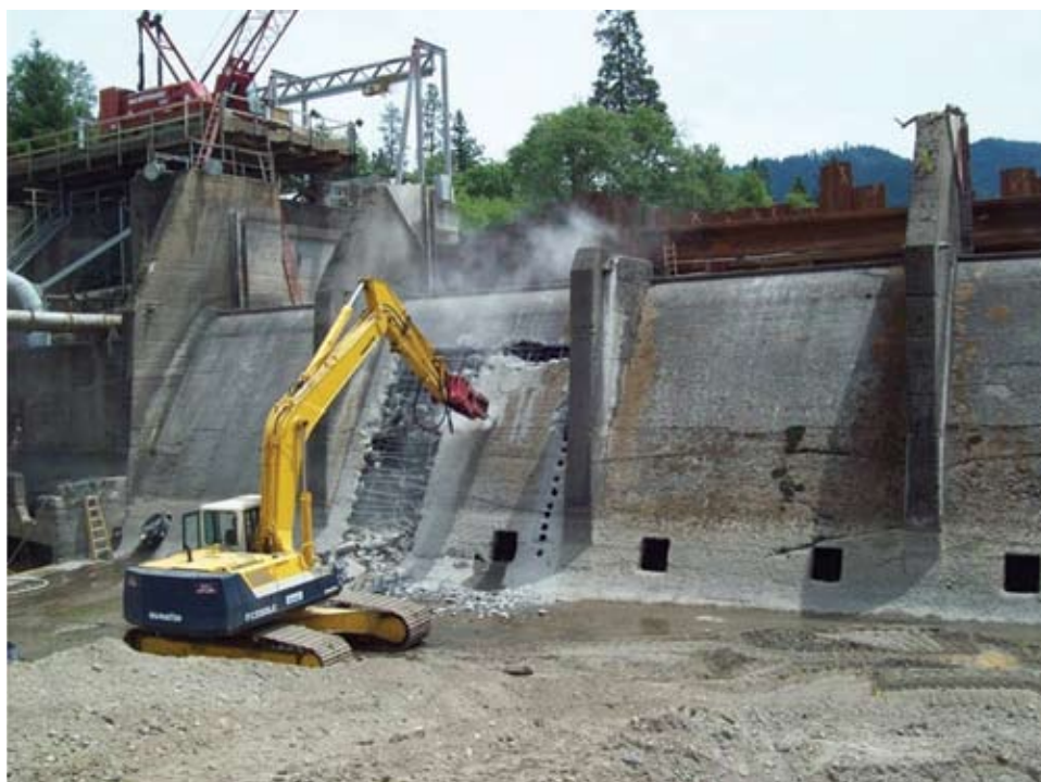
U.S. Bureau of Reclamation

And so, it's a real sense that we are not accidentally having to abide by any one local region. And that is really what the point of the nation is. One of the people who wrote about it, during the time of the TVA, was confronted with the fact that the Supreme Court would find that watersheds are illegal, because watersheds naturally cross state lines. And he was pointing out, that there is nothing in Constitution, that took into account this water basin management. But instead, what he was saying, which comes up in the original TVA, was the realization that this type of regional management is the